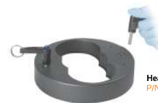
Heat-On Multi-Well holder P/N 505-80060-03