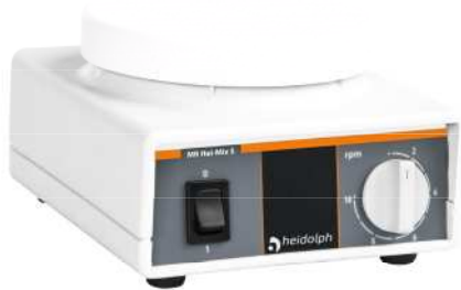
MR Hei-Mix S P/N 503-c2000-00