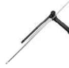
Pt 1000 clamping system (includes support rod and attachment with cable inlet) P/N 509-63100-00 Pt 1000 clamping system for bath attachments from 3 to 5 liter (includes support rod and attachment with cable inlet) P/N 509-63200-00