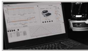
Free download of Hei-Control Software for MR Hei-Connect and MR Hei-End at www.heidolph.com/support