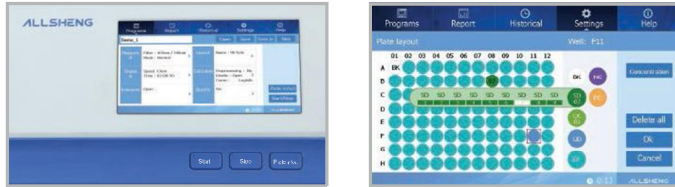
7 inch touch screen for easy operation

The AMR-100 Microplate Reader is a reliable and robust instrument for a wide variety of research and clinical applications. It reads various kinds of 96-wells plates, and is equipped with shaking function. It can be used as a stand alone instrument or under PC control with regular or APP software. It is easy-to-use the software.